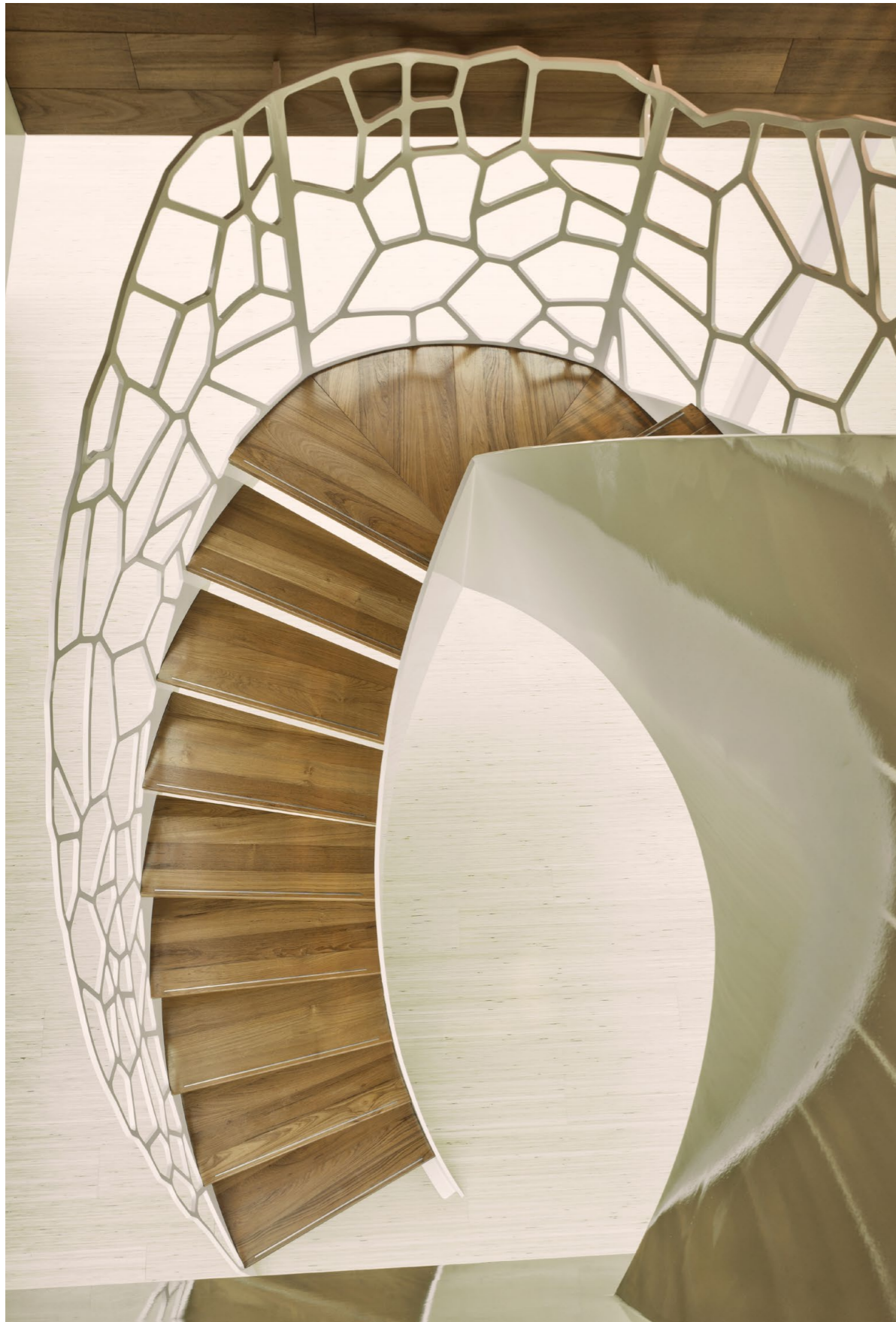
Cells™ by EeStairs